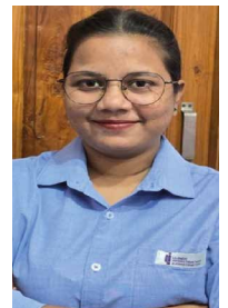
Sonali Kasture Transport