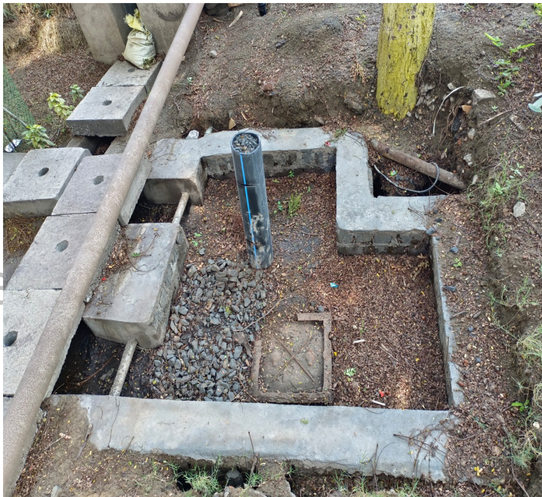
SOLAR PANELS INSTALLED AT CAR PARKING

Environment Clearance No. EC23A1003MH5973383N, File No. IA-J-11011/243/2019-IA-II (IND-I)