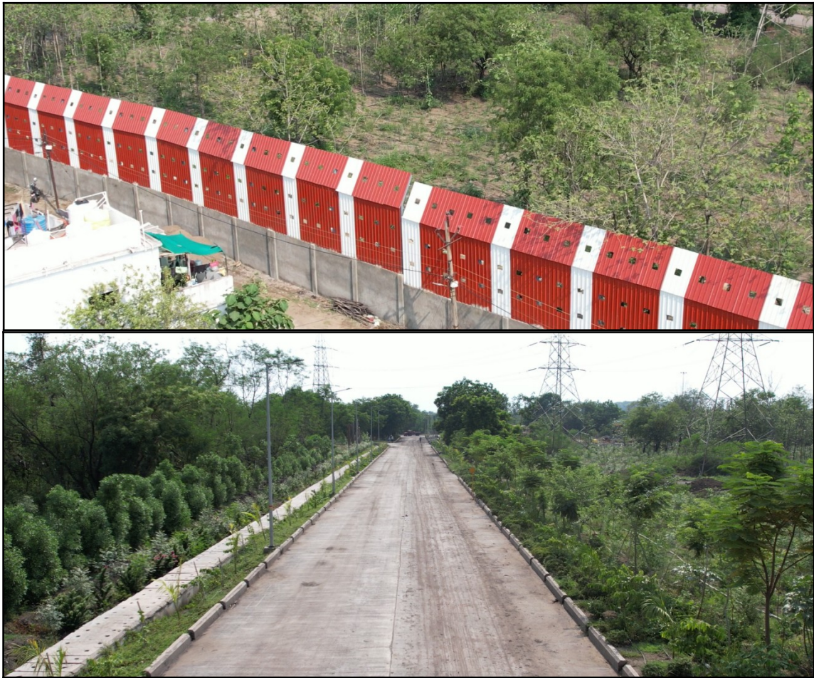
ESP Design Construction

Environment Clearance No. EC23A1003MH5973383N, File No. IA-J-11011/243/2019-IA-II (IND-I)